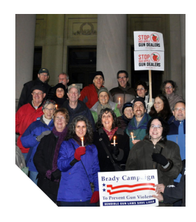
JCRC activists participate in a gun control rally in Annapolis.