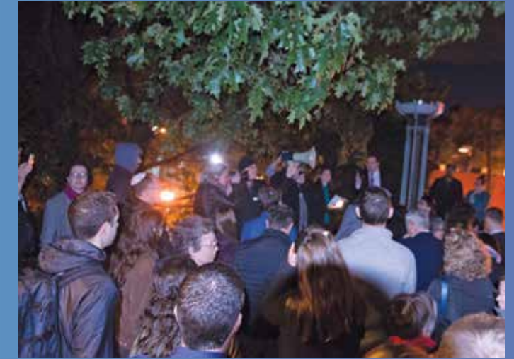
Thousands of additional community members participate in an impromptu overflow service outside of the Tree of Life vigil inside Adas Israel.